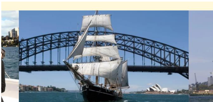
Western Swan is a magnificent three-masted barquentine built in Denmark

I am all ears if anyone has suggestions, collaborations or any other ideas on how to tie it into a cause or occasion. Otherwise the event is for sight seeing, getting out of the house, meeting students, learning about tall ships and learning about convict history. Those are still great reasons to have this event but happy to expand it even further. Can't wait!